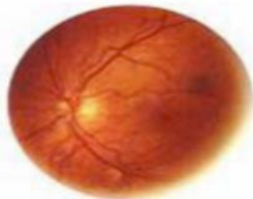
Figure 3. Image of retina [9]

It is based on the blood vessel pattern in the retina of the eye as the blood vessels at the back of the eye have a unique pattern, from eye to eye and person to person (figure 4). The retina is not directly visible and so a coherent infrared light source is necessary to illuminate the retina. The infrared energy is absorbed faster by blood vessels in the retina than by the surrounding tissue. The image of the retina blood vessel pattern is then analyzed.