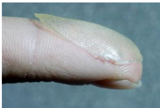
Figure 1. Forgery of fingerprints [4]

We know that despite the greater security of biometrics, these are also falsifiable and someone else can be identified instead of someone else. If we take some examples e.g. Fingerprints can be easily taken from a glass that we drank water and identified as us, our face is also very easy to take, where only a qualitative picture of us is enough to be identified, the retina also by means of a picture can be provided, so as we can see that even by these metrics we are down. In addition to fakes, we also have cases when the system itself gives access to someone else, if we take an example of facial identification on a fake phone, there are cases that guarantee someone else access due to the similarity of the face with the owner of the phone, but this happens very rarely, since biometrics have a property of updating, self- learning or evolution, thus guaranteeing access only to the authorized person, because if there was no evolution, then only with the aging of the owner, the owner of the phone would not have the opportunity to open the device.