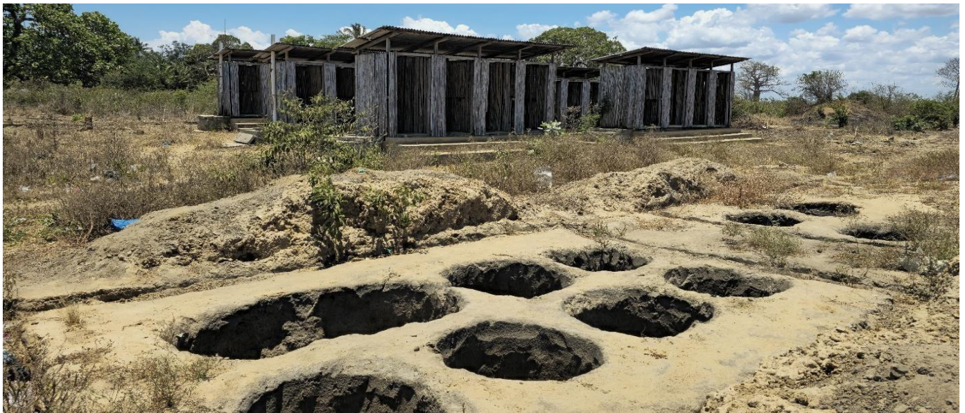
Figure 3: Abandoned latrine pits and filled pit latrines

Finally, the synthesis of intervention characteristics, environmental impacts, and adaptive innovations provides the foundation for proposing context-specific strategies for integrating environmental sustainability into emergency WASH programming in conflict-affected settings.