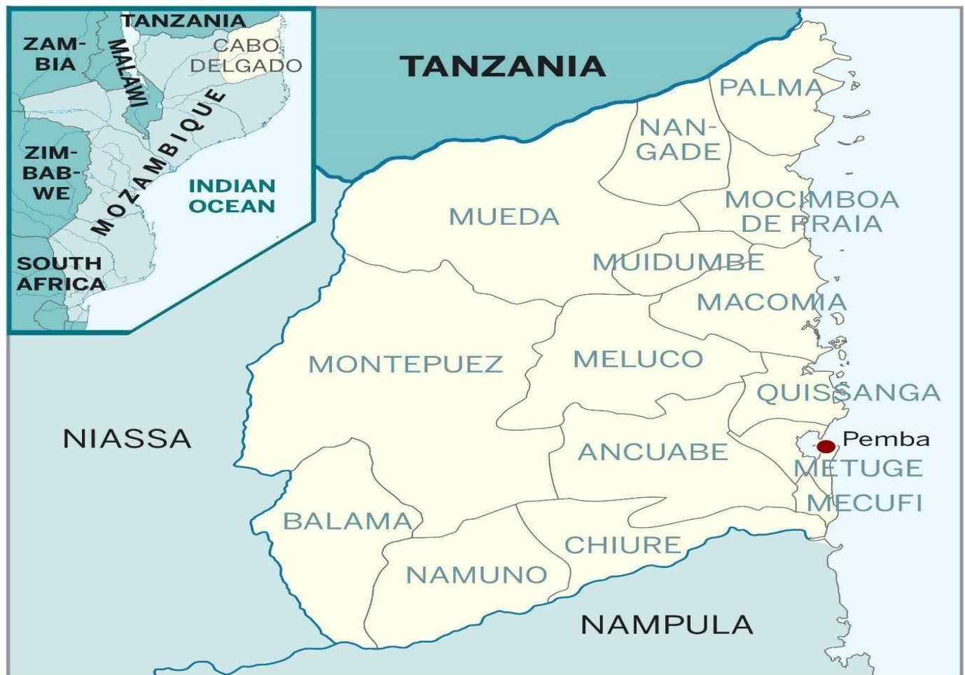
Figure 1: Mozambique – Map of Cabo Delgado Province and districts