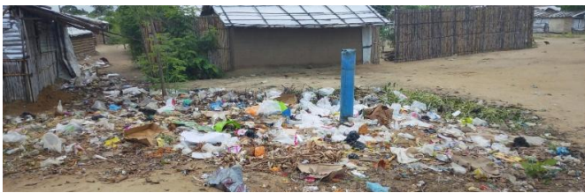
Figure 4: Accumulated waste from the distributed WASH hygiene kits in the 25 de junho IDP resettlement camp