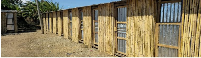
Figure 3: Emergency latrines constructed using bamboo in the IDP resettlement Camp