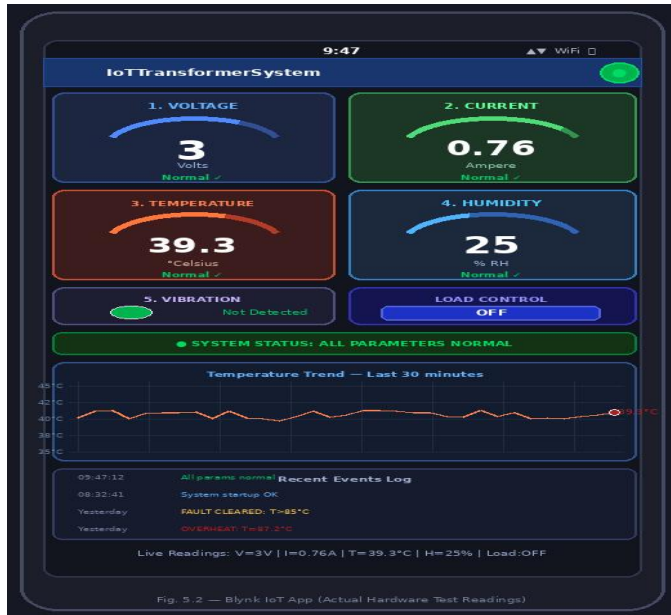
Fig. 3 Blynk IoT mobile dashboard showing live readings (V=3V, I=0.76A, T=39.3°C, H=25%) during testing

for others) is attributed to the thermal response time of the DHT22 sensor itself. Push notifications were delivered to the test smartphone within 2–4 seconds of fault confirmation.