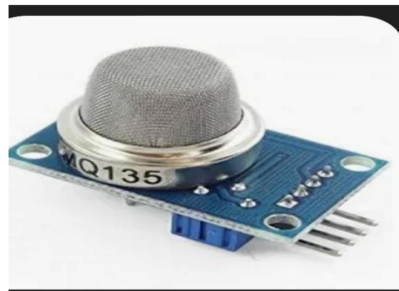
MQ-135 GAS SENSOR