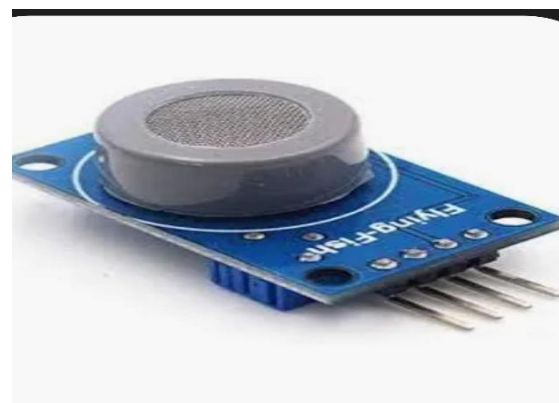
MQ -7 CO SENSOR