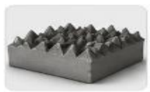
Surface Roughness Rough surfaces create more friction.