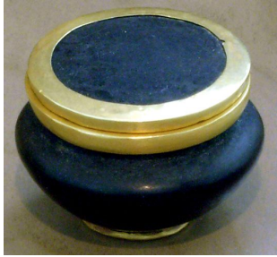
Fig.5 Obsidian Kohl pot of Sithathoryunet [15].

rim, round shoulder, convex body, medium flat base and flat lid. The lid, rim and base are shielded by gold sheets in a neat and accurate manner.