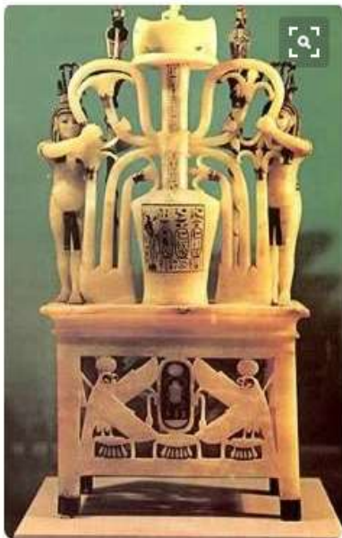
Fig.20 Pharaoh Tut alabaster vase [32,33].

on a large portion of the vase body. The structure around the neck and body consists of lily and papyrus stems with smooth curved profiles. Each side is hold by a girl wearing a crown from lily and papyrus clusters [33]. The sides of the structure represent a symbol for the unification of Upper and Lower Egypt. The base is an alabaster table supporting the alabaster vase. It is decorated by two vultures wearing the Atef Crown and holding the cartouche of the Young Pharaoh Tut. It is a wonderful piece of fantastic design and production from an Egyptian rock with the 14 th century BC Egyptian Mechanical Technology.