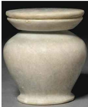
Fig.6 Anhydrite cosmetic pot from the 12 th dynasty [16].