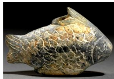
Fig.23 Kohl vessel from 18 th t 20 th dynasties [36].