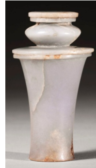
Fig.7 Anhydrite cosmetic vessel from the 12 th dynasty [17].