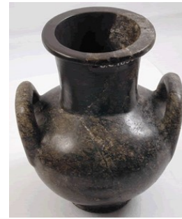
Fig.15 Steatite vase from dynasty 18 [26,27].