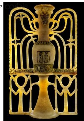
Fig.19 Alabaster vase of Tutankhamun [31].