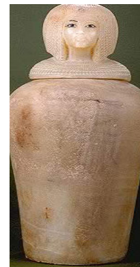
Fig.8 Alabaster canopic jar of Akhenaten daughter [19].