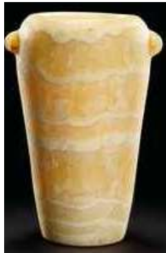
Fig.1 Alabaster jar from the Middle Kingdom [11].