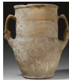
Fig.22 Alabaster jar from the 19 th dynasty [35].