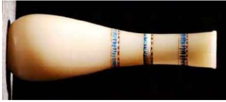
Fig.13 Alabaster tall jar from dynasty 18 [24].

Egyptian alabaster and shown in Fig.13 [24]. It has a medium mouth, round rim, long concave neck, ovoid body and big flat base. It is decorated by high polishing and 3 bands on the neck from Egyptian faience.