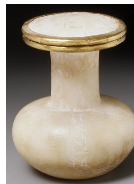
Fig.12 Calcite bottle from the 18 th dynasty [23].