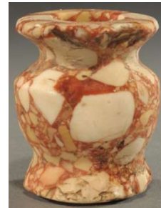
Fig.3 Breccia Kohl pot from the 12 th dynasty [13].