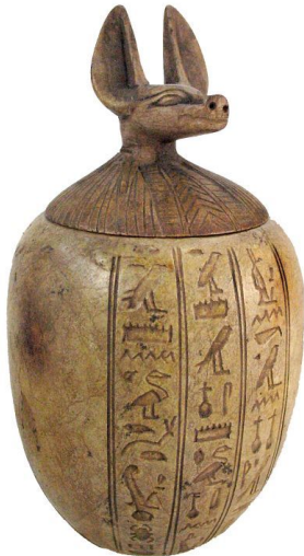
Fig.9 Limestone canopic jar from the 18 th dynasty [20].