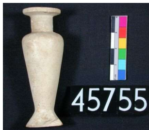
Fig.2 Limestone vase from the Middle Kingdom [12].