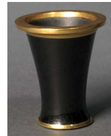
Fig.4 Obsidian cosmetic vessel from the 12 th dynasty [14].