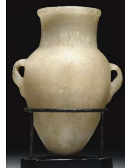
Fig.26 Alabaster jar from 3 rd Intermediate Period [40].