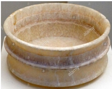
Fig.10 454 mm alabaster vessel from the 18 th dynasty [21].