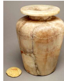
Fig.16 Travertine jar from the 18 th dynasty [28].