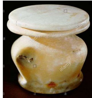
Fig.21 Alabaster Kohl pot from the 19 th dynasty [34].

body and a flat base with round flange. It has two big handles between the neck and shoulder. The finishing is not good.