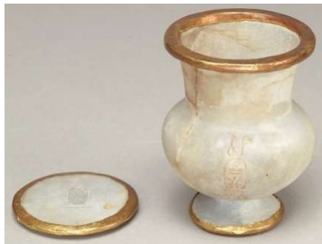
Fig.14 Anhydrite jar from the 18 th dynasty [25].

Another model belongs to Pharaoh Thutmose III of the 18 th dynasty which is an Anhydrite jar having wide mouth and neck located in the Metropolitan Museum of Art and shown in Fig.14 [25]. The rim is round and inlaid by gold sheet, the neck is wide and has a medium length, the body is ovoid, the base is flat at the end of cylindrical foot.