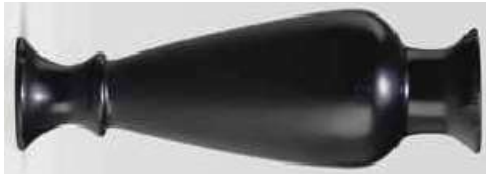
Fig.24 Obsidian jar from 18 th -20 th dynasties [37].