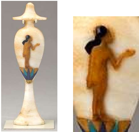
Fig.18 Travertine perfume bottle from the 18 th dynasty [30].