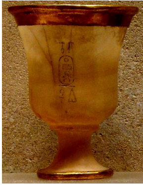
Fig.17 Alabaster goblet from the 18 th dynasty [29].