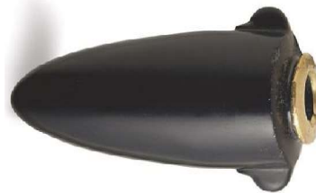
Fig.27 Obsidian vase from 22 nd -23 rd dynasties [41].