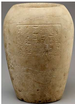
Fig.25 Canopic jar from the 21 st dynasty [39].